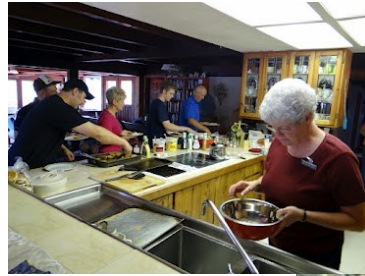
"We" did our own cooking—and all of it was excellent!