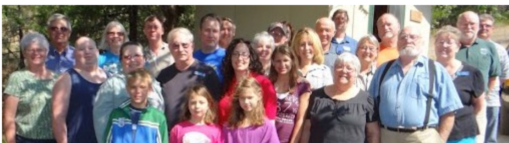
Above—Most of the attendees at the Staff Rendezvous 2012