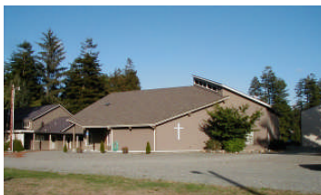
Ft. Dick Bible Church

Moreland Bible Church , Portland, OR — create new space from burned parsonage, Summer '05