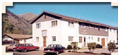
Indian Bible College

Arizona 2006 Major work is planned at Indian Bible College next year. Project supervisor and all trades will be