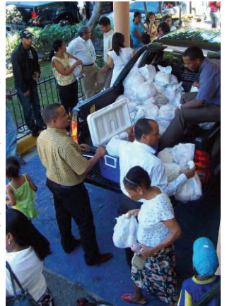
Distributing food bags to the poor after morning service at Iglesia de Comunidad

moving forward with ministry expansion on many fronts. It was exciting to see them determined to follow God's leading and call, and to invite us to come alongside them in the work — rather than to be dependent on American church "foreign aid", so to speak. They have already acquired a property with a large house needing tons of TLC. Plans for refurbishing it, as well as erecting the other buildings on the site, are on the drawing boards.