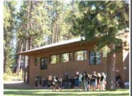
There will finally be a way to get into the dining hall from the backside - and eliminate that nasty drop out the sliding glass doors!

Remember the project at Post Falls a couple of years ago where Hard Hats teamed up with MMAP to build two staff cabins? Well, Hard Hats is going back again for another project!